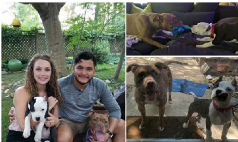
Helmutt Pupperer simply would not have survived without the intensive medical care funded by Friends. Thanks to individuals like you, today HP enjoys snuggles and tug o' war. Who can resist that darling face? Especially when it's smooshed into the screen door!