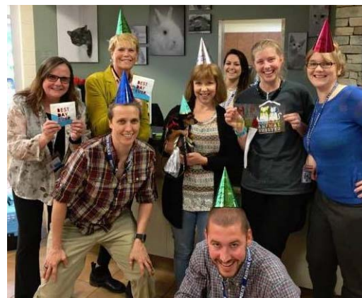
Pictured above: Delighted with the "foster failure," Shelter staff celebrated the signing of the adoption papers. Even Chewy's wearing a party hat!

Foster failure: It happens to the best of foster families; even those who have been doing it for years! In Chewy's case, he won hearts, and it was clear to the temporary family that Chewy had found his forever home.