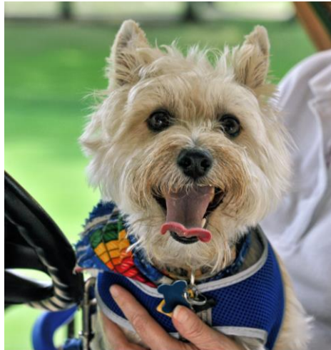
Official FFCAS Mascot Eddie