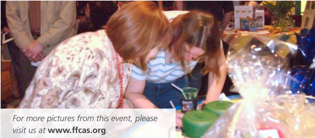
For more pictures from this event, please visit us at www.ffcas.org .